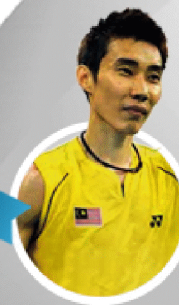
Lee Chong Wei